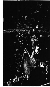
By Theme Session