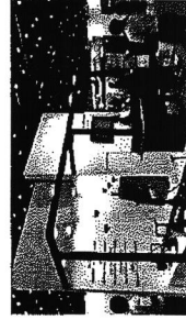
Booth / Workshop