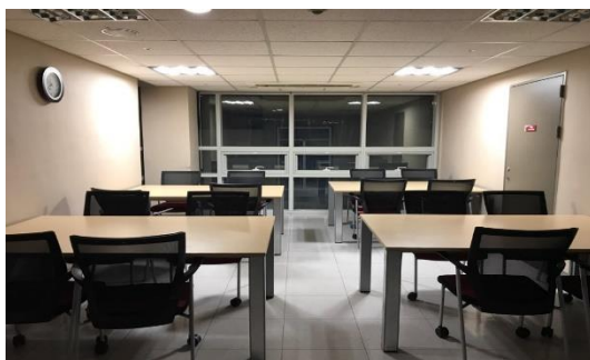
<Anam Global House Study Room>