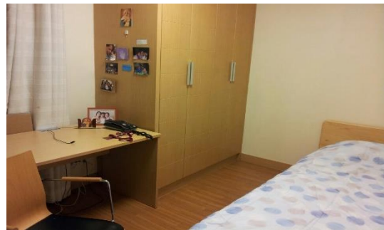
<Anam Global House Room>