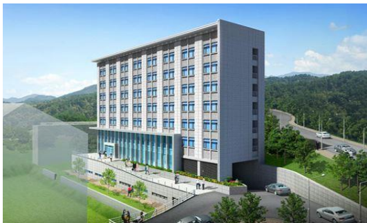
<Anam Global House>