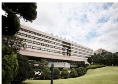
<KU Medical Center>